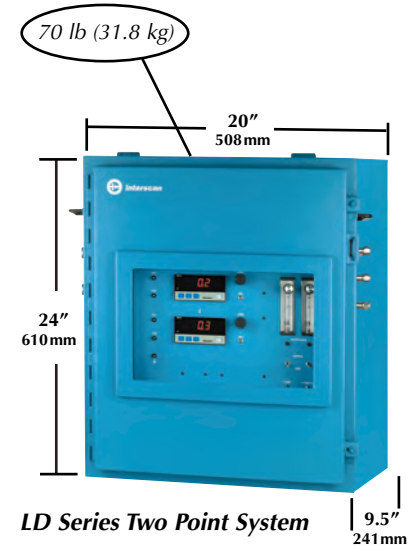
LD Series Two Point System