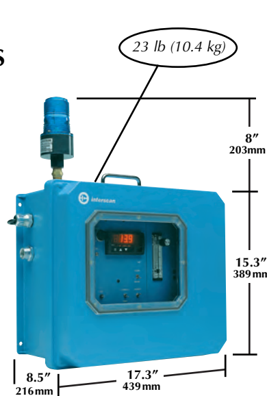
LD Series Single Point System

The two point version of our LD Series gives you two continuously operating monitoring channels in one convenient package. All the features of the single point unit are included—times two—with dual display controllers, dual pumps and rotameters, and dedicated alarm features for both channels.