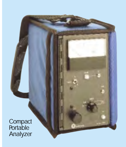
Compact Portable Analyzer

Our Multipoint Systems are intended for monitoring several different locations within the same general area. Custom designed to meet your exact needs, they offer a cost-effective and organized means to protect an area and document its condition, as well. Full data acquisition capability is available with the Multipoint Systems, and with all of our instruments.