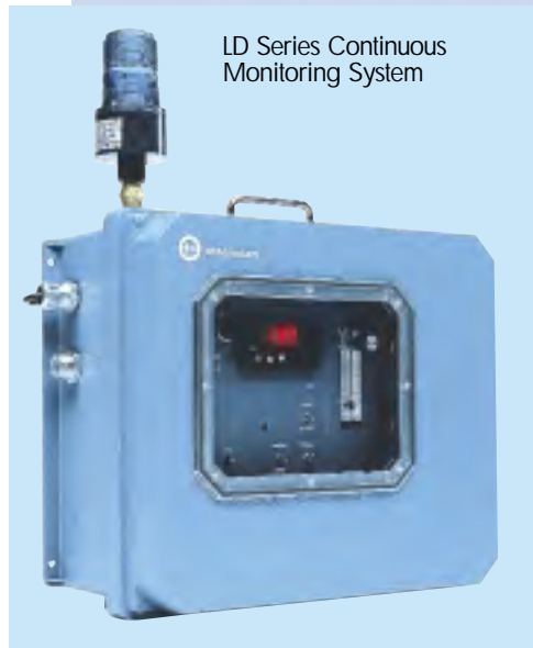
LD Series Continuous Monitoring System