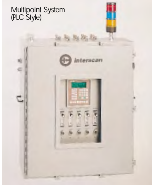
Multipoint System (PLC Style)